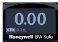
Easy to read