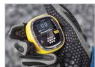
Easy to handle