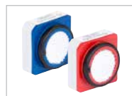
Easy to service